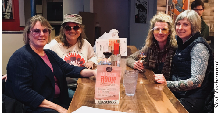
▲ Scenes from the 2019 Spring Break Up Party. Please join us this coming February!