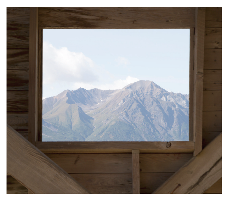
Artist in Residence