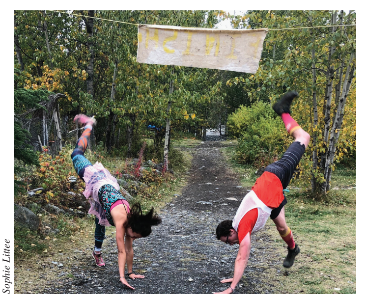
▲ Winners from this year's five-mile race cartweel across the finish line.