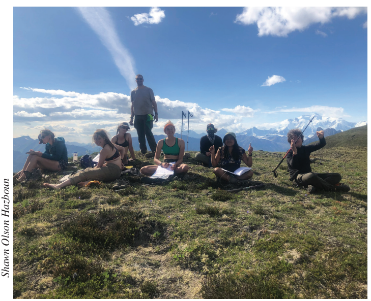
▲ Students learning and enjoying the alpine of the Wrangells on a sunny day.

▶ Hiking through an ice bridge on the edge of the Kennicott Glacier.