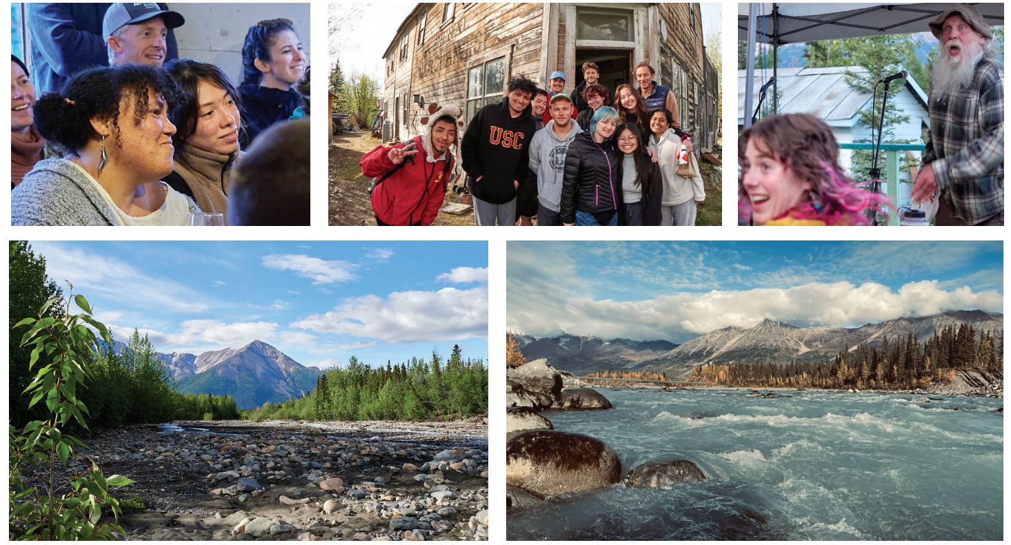
The Wrangell Mountains Center is located on the traditional and ancestral homelands of the Ahtna Athabascan Peoples. We acknowledge and honor the land stewardship and place-based knowledge of the Peoples of this territory.